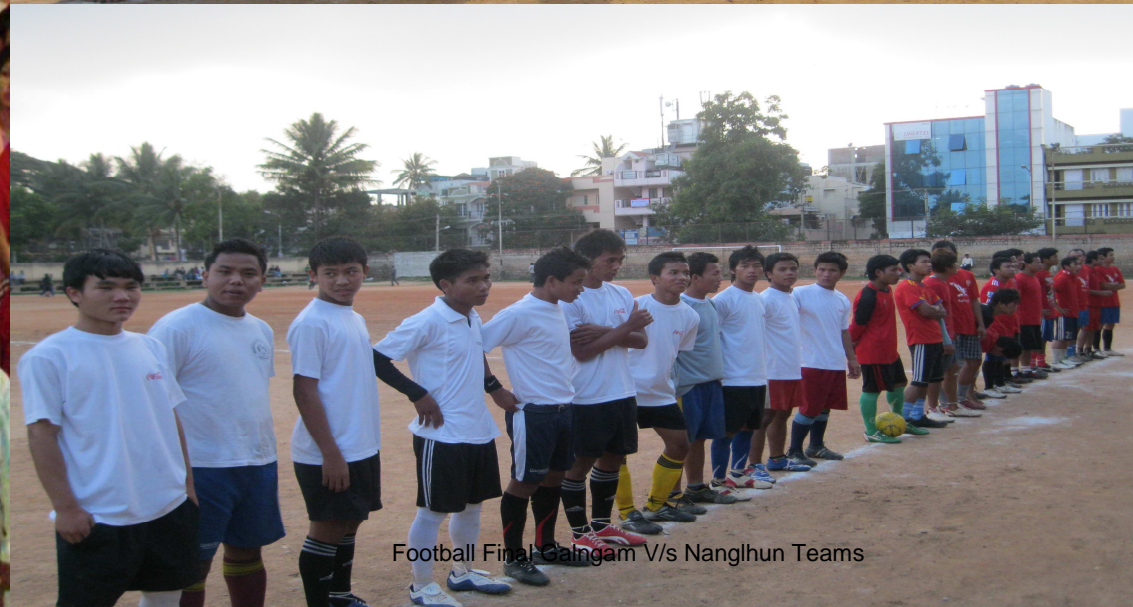
Football Final Galngam V/s Nanglhun Teams