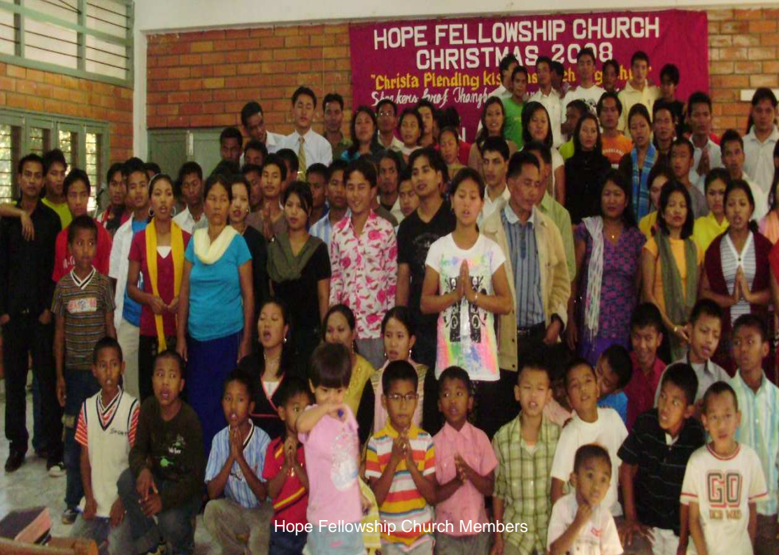
Hope Fellowship Church Members