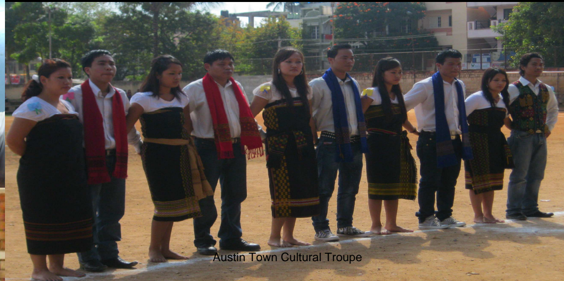
Austin Town Cultural Troupe